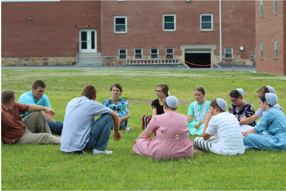
Team Building Activity Discussion - WATER Training Week.

( W orld A wareness T raining in E vangelistic R esponsibility)