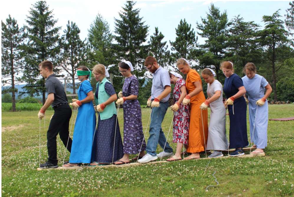
Team Building Activity - WATER Training Week.

( W orld A wareness T raining in E vangelistic R esponsibility)