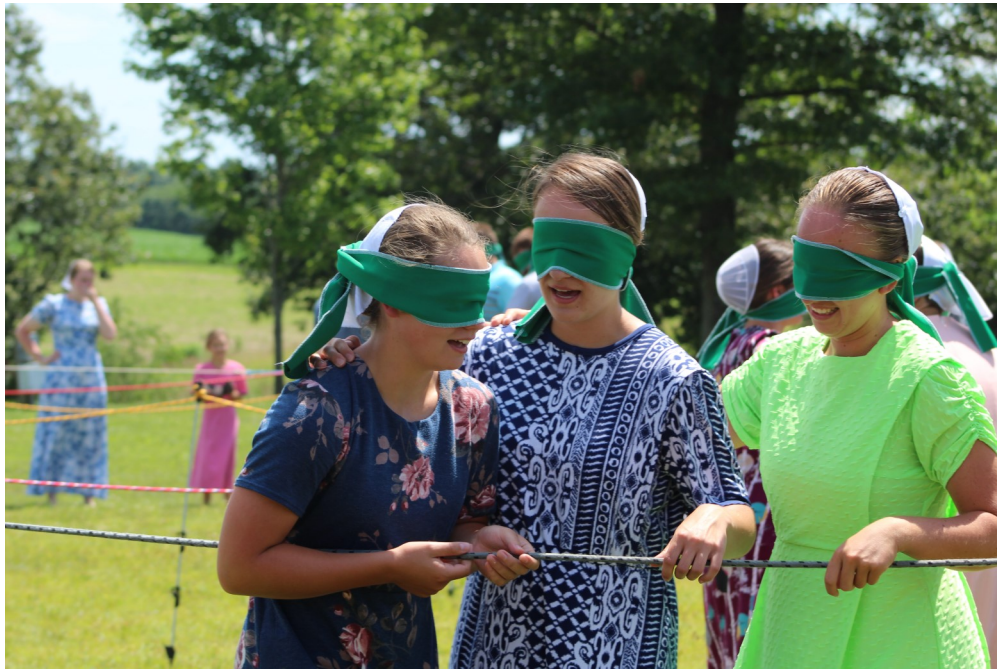
Team Building Activity - WATER Training Week.