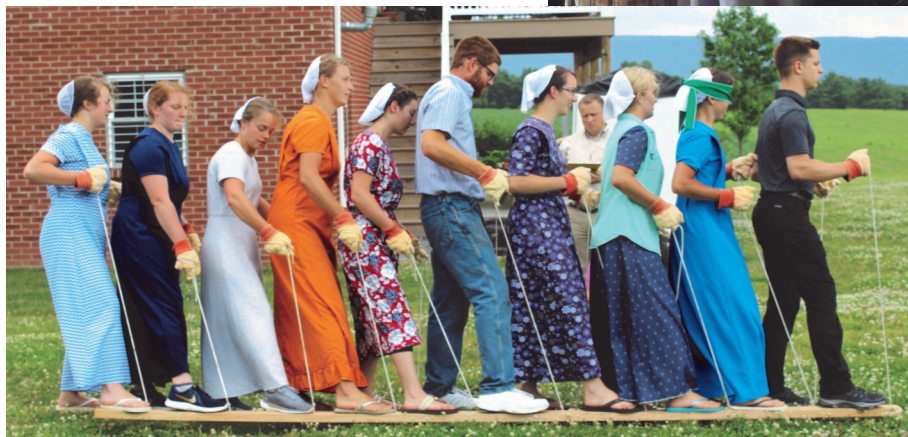
Water Training Week Team Activity