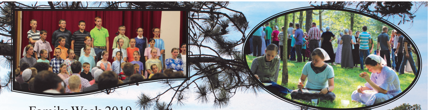
Family Week 2019