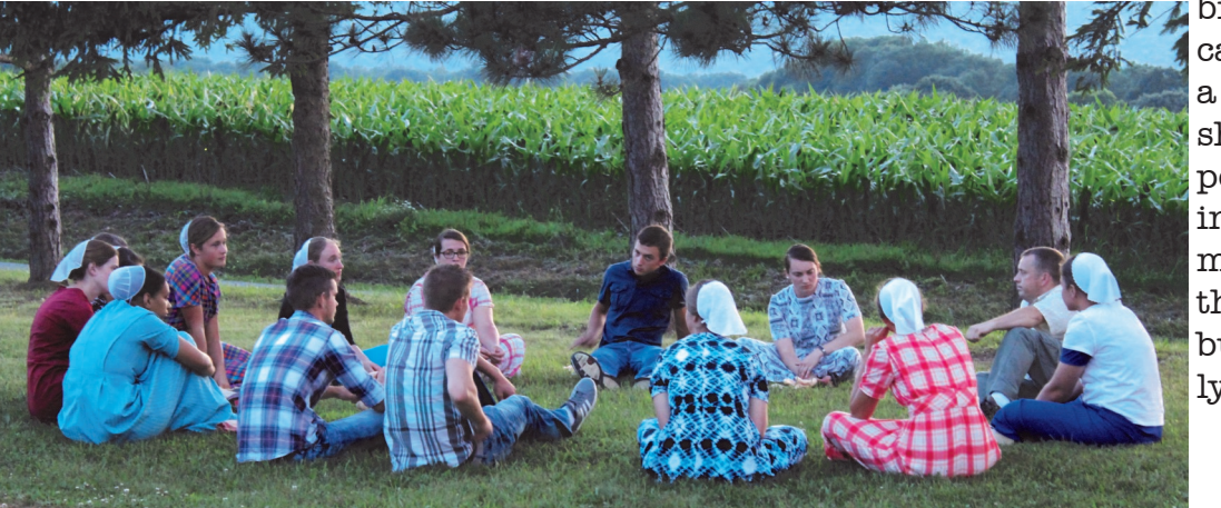
Group discussion at WATER orientation