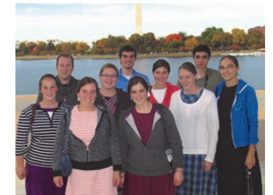
Music Ministry Team

Wilderness Development takes the student into the wilderness to continue the training and personal growth established during term. Intense canoe or hiking trips provide opportunity to deepen relationships with God and others.