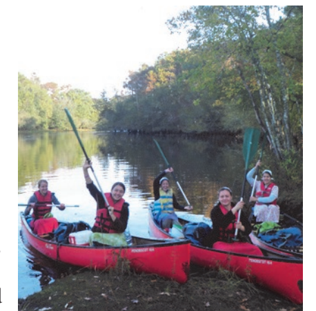
Ladies' Wilderness Trip