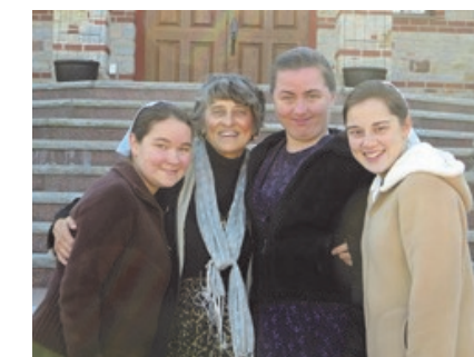
Ministry in Wilkes-Barre, PA

Urban Ministry is an opportunity for hands on experience in urban ministries. Opportunities may include homeless shelters, hospitals, kids clubs, community service, etc.