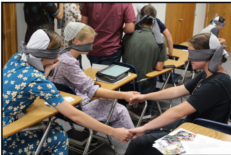
Team Building Activity - WATER Training Week.

This five-week apprenticeship program is designed to place young people on the mission field to work under conservative Anabaptist missions. In consultation with parents and pastor, we encourage you to consider SMBI's WATER training. If you have been wanting to see and experience mission work first-hand with the missionary as your teacher, WATER will provide you with that opportunity. You will receive training workshops, lectures on mission themes, documentaries, fellowship, and recreation for one week on the SMBI campus. Then you will be placed on the mission field of your interest to see and do what missionaries do. The five-week training will conclude with a day back at SMBI to share with each other and to receive further training and encouragement. Six study hours will be given to anyone successfully completing this program. See pages 40-47 for program details.